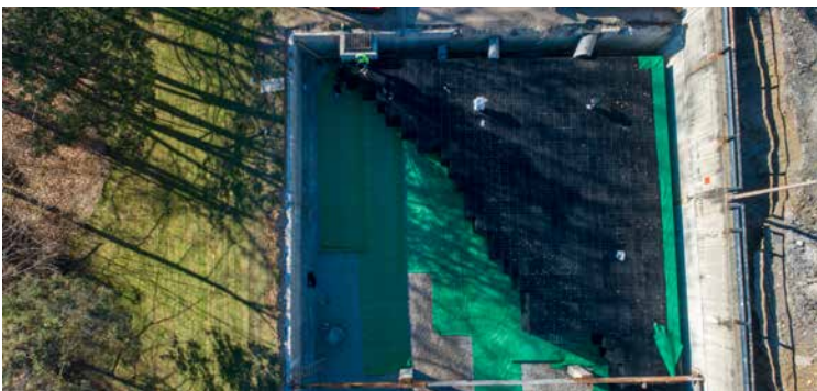
R-Tank HD Pent 7-ft modules filled the existing concrete footprint.