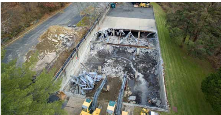
Prior to installation

R-Tank HD Pent 7-ft modules were selected to replace the existing system due to the high void space and cover parameters. To allow for the passage of water from the tanks to the perimeter stone, the system was wrapped in SR-18 microgrid. Additionally, TrashGuards were placed in the upstream drains feeding into the system for collection of sediment, trash and debris.