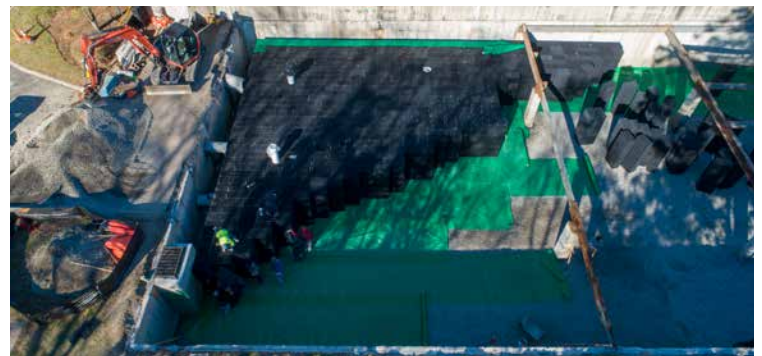
The system was wrapped in SR-18 microgrid (pictured in green).