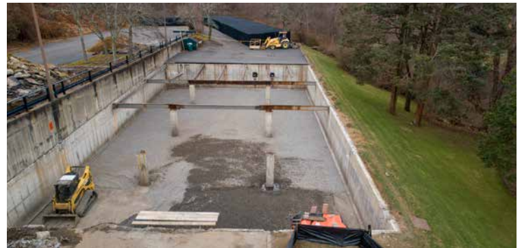
Base prep for the installation of the system.