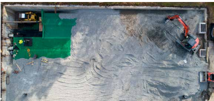
Crushed stone cover layer placed over the tanks and SR-18 microgrid prior to final layers.