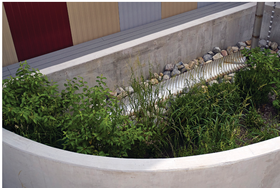
Inside view of the planted FocalPoint biofiltration planter box system.

*All images taken by ©Tom Holdsworth Photography. No distribution to 3rd party—NO EXCEPTIONS.