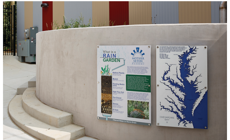
Educational placards for outdoor lessons.