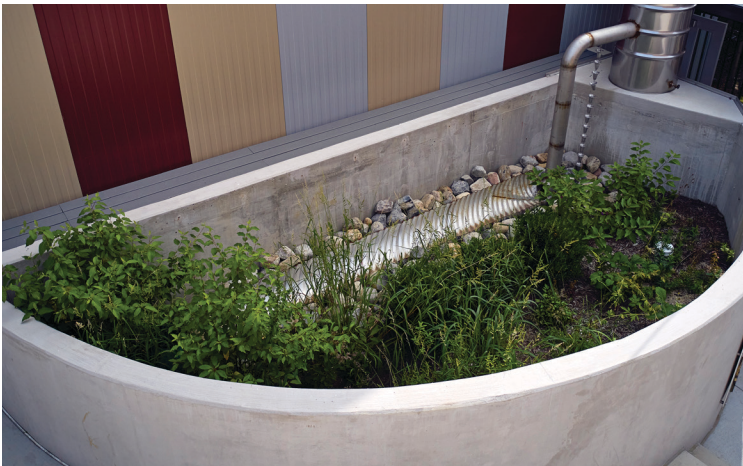
Finished FocalPoint planter system in courtyard.