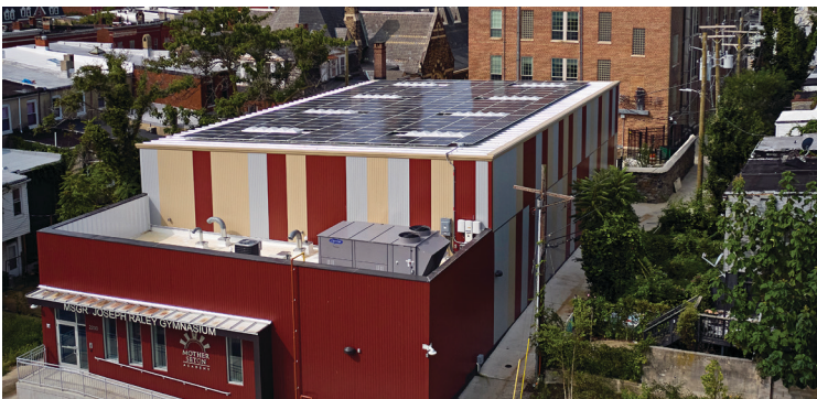
Cramped space and angled roof of the school.

The school building features an angled roof that directs stormwater to one central rain spout. Captured stormwater is then filtered into a cistern for treatment, and overflow is discharged down a rain chain, through a pipe, and then into a trough which evenly distributes flow across the planter system. The FocalPoint high flow media works in combination with the plantings in the bed to filter the captured runoff. Below the planter, R-Tank modules were added for additional rainwater storage capacity.